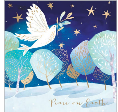
Example e-card design uploaded by one of our charity partners.